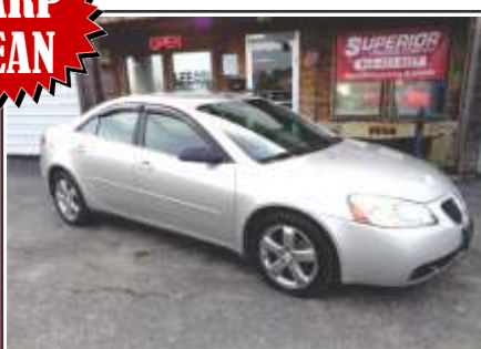
2009 PONTIAC G6 GT