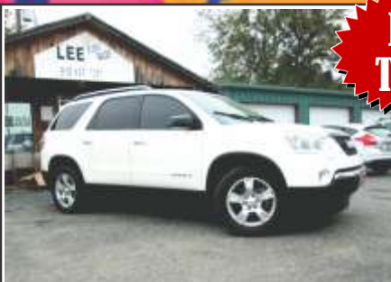
2008 GMC ACADIA