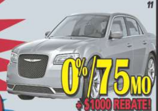
2015 CHRYSLER 300S