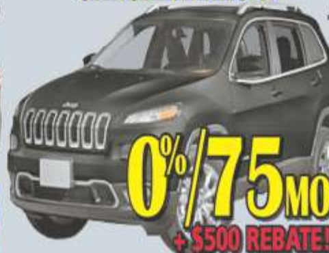
2015 JEEP CHEROKEE LATITUDE

LOW-BACK BUCKETS SEATS, SIRIUS SATELLITE RADIO, 2ND ROW BUCKETS W/FOLD-IN-FLOOR, AMERICAN VALUE PACKAGES