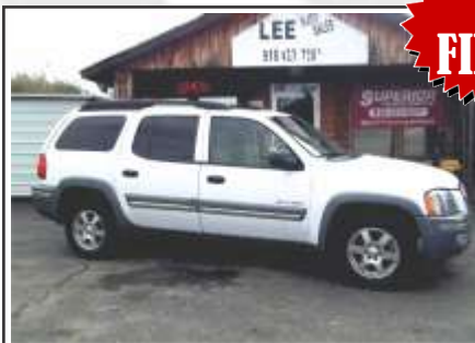
2005 ISUZU ASCENDER