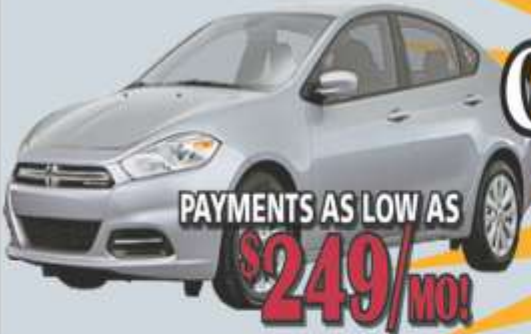
2015 DODGE DART SE