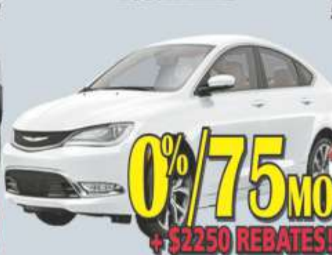
2015 CHRYSLER 200 LIMITED

6.7L CUMMINS TURBO DIESEL, SPRAY-IN BEDLINER, PARKVIEW(TM) REAR BACKUP CAMERA, PARKSENSE REAR PARK ASSIST SYSTEM, UCONNECT 5.0 AM/FM/BT, POPULAR EQUIPMENT GROUP, CHROME APPEARANCE GROUP, CUSTOMER PREFERRED PACKAGE