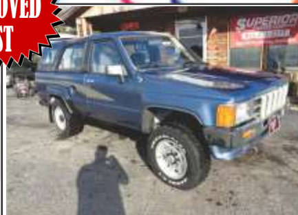
1989 Toyota 4 Runner