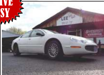
2000 CHRYSLER CONCORDE