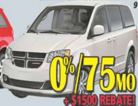
2015 DODGE GRAND CARAVAN

LOW-BACK BUCKET SEATS, UCONNECT VOICE COMMAND W/BLUETOOTH, FLEXIBLE SEATING GROUP, AMERICAN VALUE PACKAGE