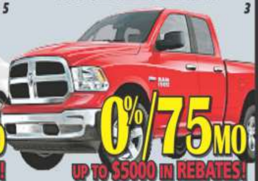
2015 RAM 1500 SLT CREW CAB 4X4

9-SPD AUTO, BUCKET SEATS, CUSTOMER PREFERRED PACKAGE