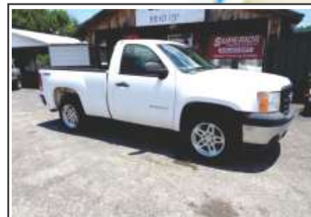
2011 GMC SIERRA 1500