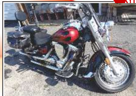
1999 Yamaha XV 16