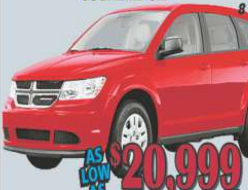
2015 DODGE JOURNEY SE

3.6L V6, 8-SPD AUTO, LEATHER-TRIMMED SPORT BUCKET SEATS, CUSTOMER PREFERRED PACKAGE