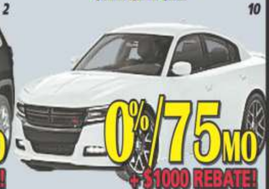
2015 DODGE CHARGER SXT

CUSTOMER PREFERRED PACKAGE, BUCKET SEATS, UCONNECT 8.4, COMFORT/CONVENIENCE GROUP