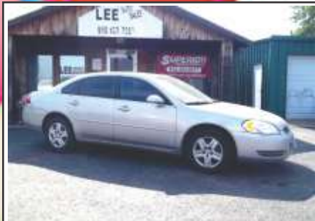
2008 CHEVY IMPALA