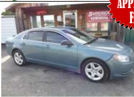
2009 CHEVY MALIBU LS