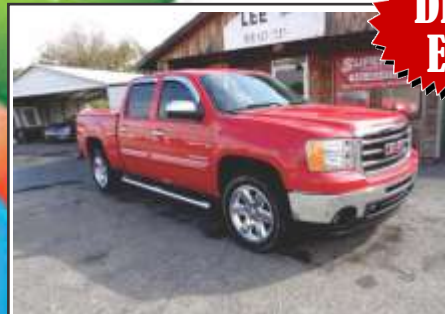
2013 GMC SIERRA 1500