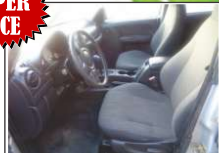
2001 Ford Explorer