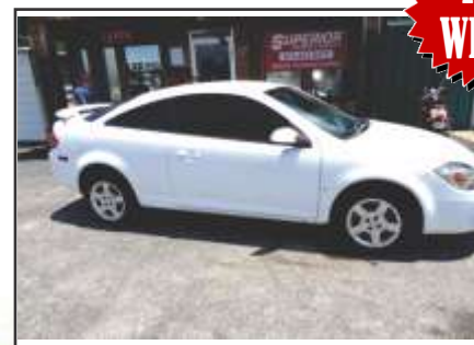
2009 PONTIAC G5