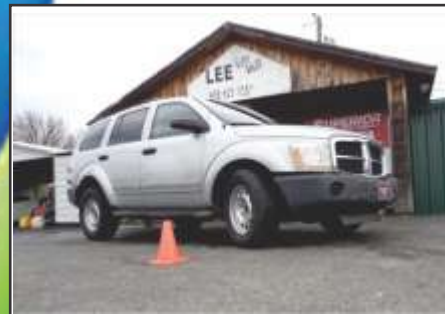
2004 Dodge Durango