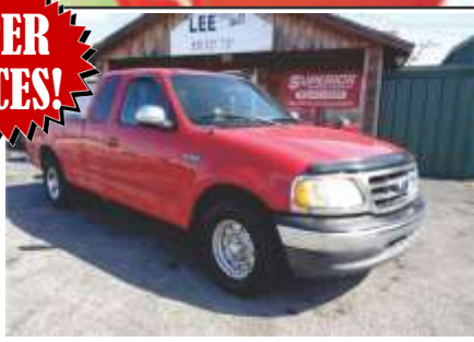
2001 FORD F-150