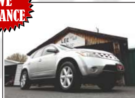
2004 NISSAN MURANO