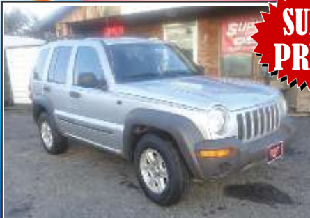
2004 Jeep Liberty

1300 SOUTH MAIN-McALESTER • 918-423-7887