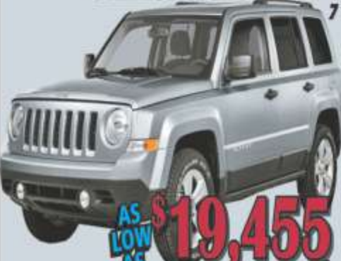
2015 JEEP PATRIOT SPORT

OVER 200 NEW CARS IN STOCK IN DURANT, OK!