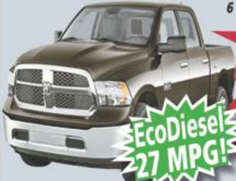
2015 RAM 1500 CREW CAB SLT 4X4

5.7L V8 HEMI, BUCKET SEATS, UCONNECT 8.4NAV, ANTI-SPIN DIFFERENTIAL REAR AXLE, CUSTOMER PREFERRED PACKAGE