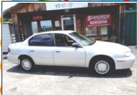
2004 Chevrolet Classic