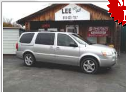
2007 CHEVY UPLANDER