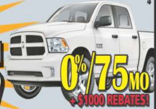
2015 RAM 1500 4X4 TRADESMAN/EXPRESS CREW CAB

CUSTOMER PREFERRED PACKAGE, CONVENIENCE GROUP, SE RALLYE PACKAGE