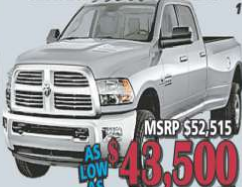
2015 RAM 3500 TRADESMAN CREW CAB 4X4

BUCKET SEATS, POWER VALUE GROUP, CUSTOMER PREFERRED PACKAGE