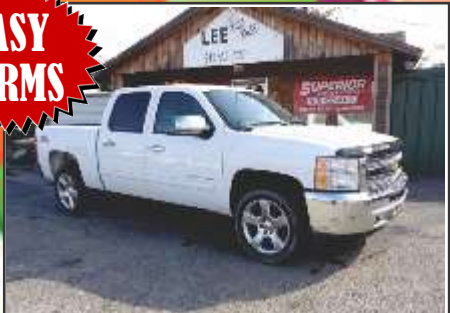
2013 Chevy Silverado 1500