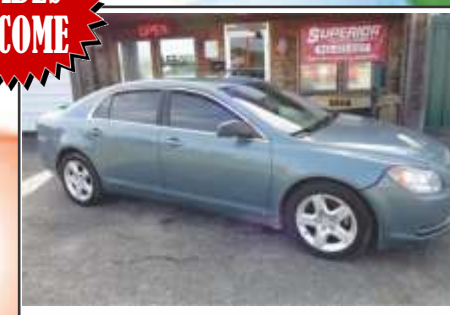
2009 CHEVY MALIBU