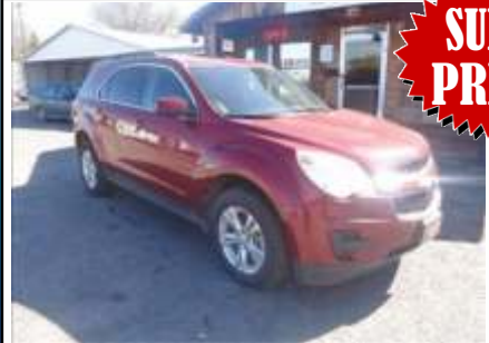
2010 Chevrolet Equinox

1300 SOUTH MAIN-McALESTER • 918-423-7887