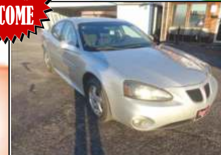
2004 Pontiac Grand Prix