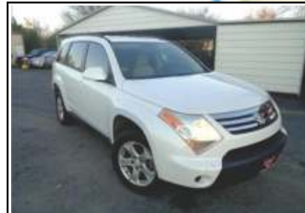
2007 Suzuki XL7