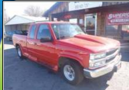
1992 Chevy C/K 1500