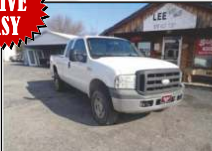
2005 Ford F250 SD