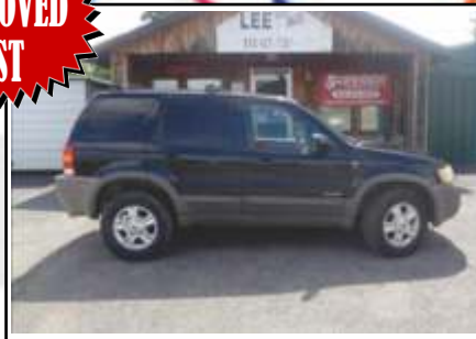
2002 Ford Escape