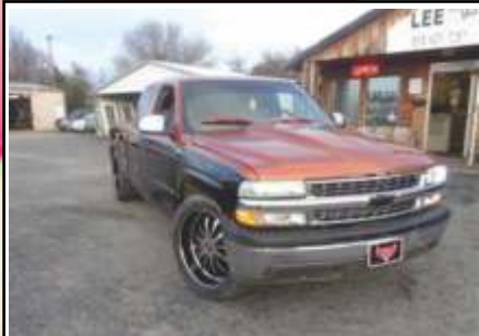
2000 Chevy Silverado 1500