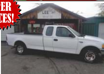
1998 Ford F-150