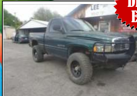
2000 Dodge Ram