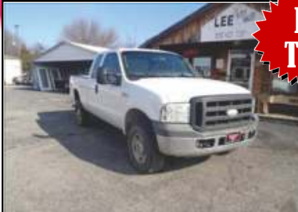
2005 Ford F-250 SD