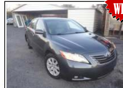
2008 Toyota Camry