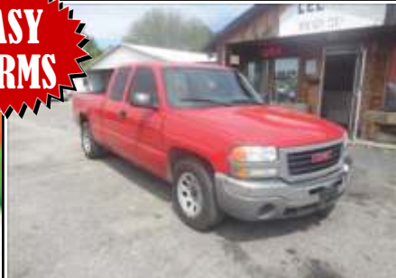
1999 GMC Sierra 1500