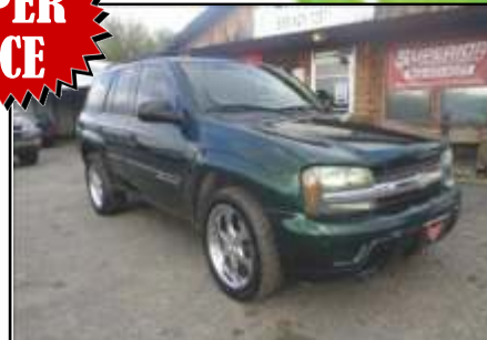
2002 Chevy Trailblazer