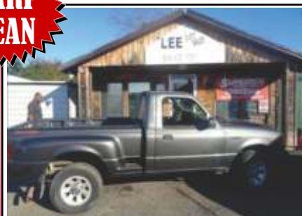
2004 Ford Ranger