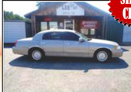
2001 Lincoln Town Car