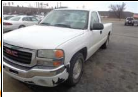
2004 GMC Sierra 1500