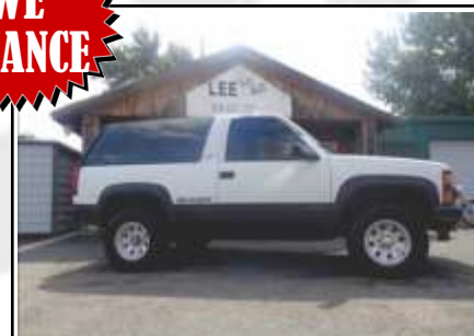
1994 Chevy Blazer