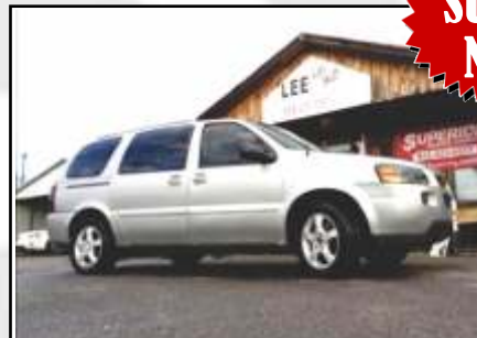
2007 Chevy Uplander