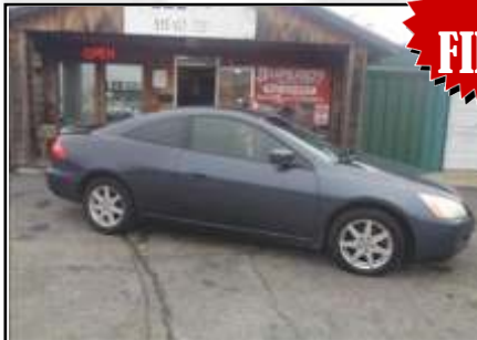
2003 Honda Accord