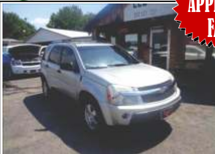
2005 Chevy Equinox