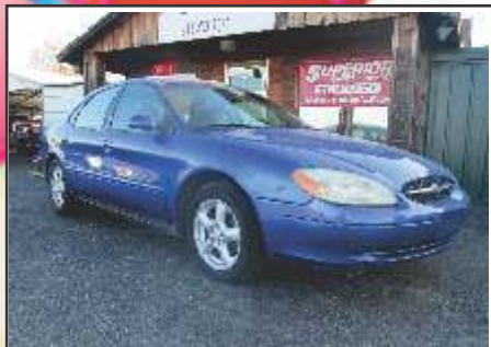
2003 FORD TAURUS