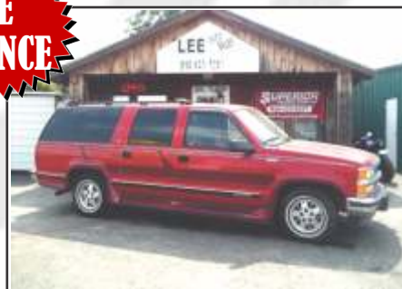
1994 CHEVY SUBURBAN 1500