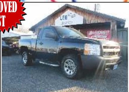
2008 CHEVY 1500