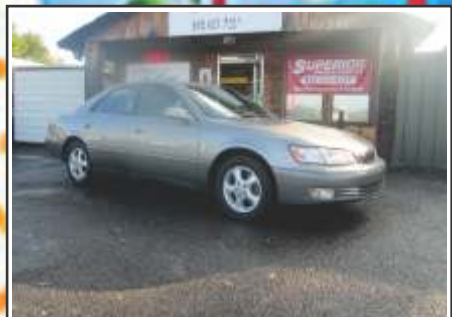
1999 LEXUS ES 300