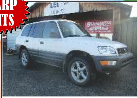
1998 TOYOTA RAV