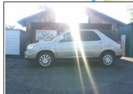
2005 BUICK RENDEZVOUS FWD