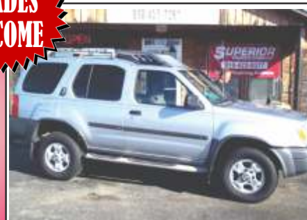
2000 NISSAN XTERRA XE