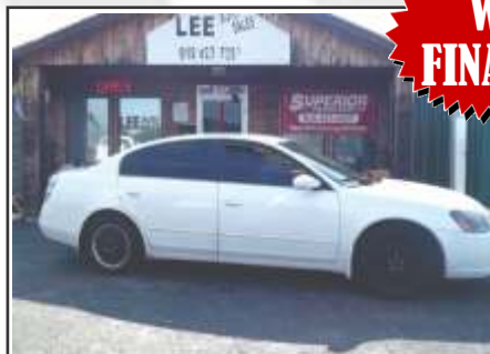
2006 NISSAN ALTIMA