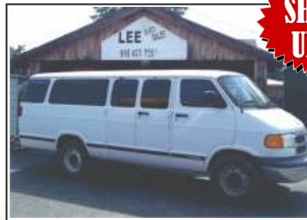
2001 DODGE RAM 3500 MAXI