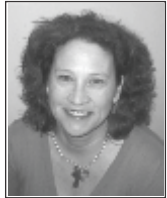
By: Gina Stanley

The latest verbal faux pas to catch nationwide heat was of course, a duck call straight from the swamps of Louisiana. In the few short weeks that have spanned the controversy, people