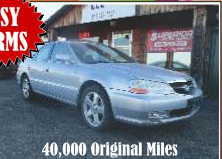
2002 ACURA 3.2 TLS