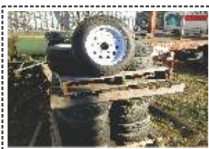
Carlisle Sport Trail 4.80 x 12, Five Hole Tire & Wheels. New, $25 each or swap/trade for equipment or livestock. "The Swap Shop" BUY-SELL-TRADE 702.W. Main, Durant 580-931-8989 580-795-6435