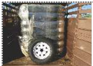
Tex-Star 205 x 75-15 New Trailer Tires & Wheels. $65 each or swap/trade for equipment or livestock. "The Swap Shop" BUY-SELL-TRADE 702.W. Main, Durant 580-931-8989 580-795-6435