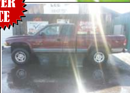
2002 DODGE DAKOTA CLUB CAB