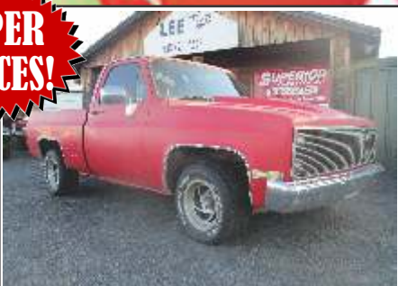
1986 CHEVY 1500