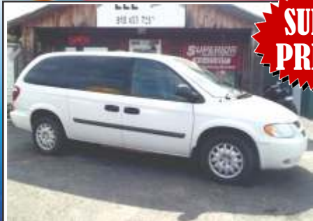
2007 DODGE GRAND CARAVAN

1300 SOUTH MAIN-McALESTER • 918-423-7887