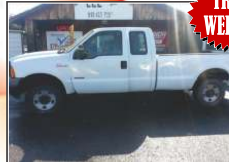
2005 F-250 SUPERCAB LARIAT