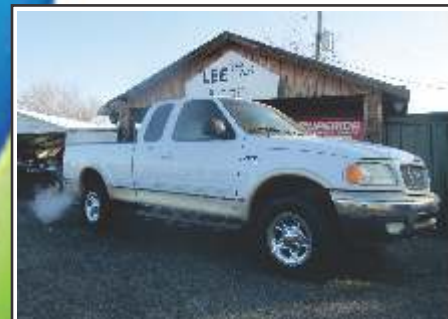
1999 F150 LARIAT