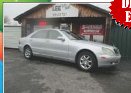
2000 MERCEDES S CLASS