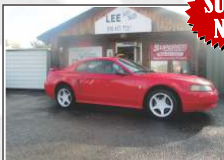
2002 FORD MUSTANG