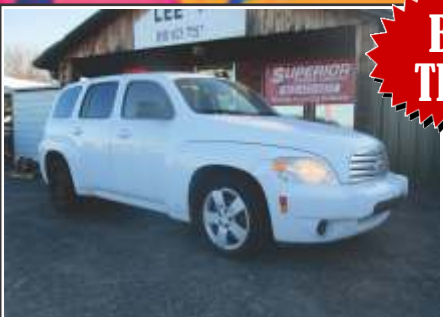
2008 CHEVY HHR