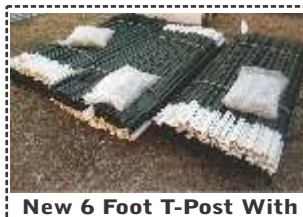
New 6 Foot T-Post With Clips $3.50 each; Five Bundles of 200; Swap/Trade for other equipment or livestock. "The Swap Shop" BUY-SELL-TRADE 702.W. Main, Durant 580-931-8989 580-795-6435