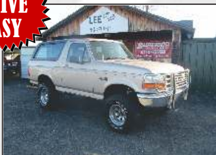
1994 FORD BRONCO