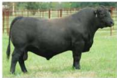
3F SUCCESSOR 6757 Reg: 18612884 DOB: 02/17/2016 Sire: EXAR Successor 4535B Dam: Zebo Queen 357 CED +7, BW +2.2, WW +84, YW +138, SC +1.16, Milk +20, CW +70, Marb +.82, REA +.73, SW +79.53, SB +183.37