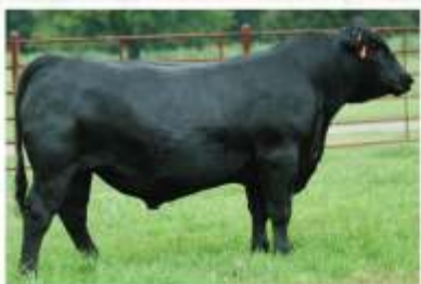
3F RAMPAGE 6951 Reg: 18794828 DOB: 08/01/2016 Sire: Quaker Hill Rampage 0A36 Dam: Rita 1P5 of 8MC8 Protege CED +9, BW +1.0, WW +76, YW +130, SC +74, Milk +16, CW +58, Marb +.80, REA +1.20, SW +62.48, SB +177.97

75 Bulls • 10 Elite Spring Yearling 65 Coming Two-Year Olds 20 Fall Yearling ET heifers 10 Spring Bred heifers with many carrying the AI service of the ever popular 3F Epic 4631.