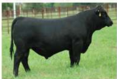
3F ABSOLUTE 6878 Reg: 18794803 DOB: 09/05/2016 Sire: K C F Bennett Absolute Dam: V N A R Rose 4070 CED +8, BW +2.0, WW +70, YW +119, SC +81, Milk +21, CW +54, Marb +.65, REA +.55, SW +65.55, SB +172.67