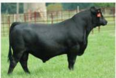
EXAR EPIC 6339B Reg: 18506296 DOB: 07/22/2016 Sire: 3F Epic 4631 Dam: EXAR Blackcap 3012 CED +14, BW -2.3, WW +60, YW +107, SC +65, Milk +27, CW +35, Marb +.60, REA +.66, SW +70.74, SB +109.34