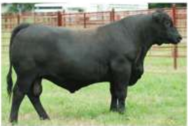
3F SUCCESSOR 6768 Reg: 18612887 DOB: 02/14/2016 Sire: EXAR Successor 4535B Dam: Zebo Queen 307 CED +6, BW +3.4, WW +85, YW +144, SC +1.64, Milk +21, CW +66, Marb +.89, REA +.73, SW +74.45, SB +179.69