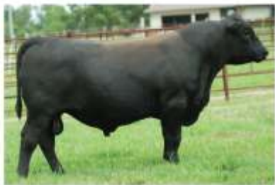
3F RAMPAGE 6786 Reg: 18614489 DOB: 02/05/2016 Sire: Quaker Hill Rampage 0A36 Dam: EF Lady 8546 CED +5, BW +2.0, WW +76, YW +127, SC -14, Milk +31, CW +53, Marb +1.06, REA +1.00, SW +77.23, SB +170.08