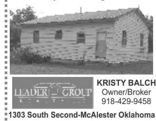
1303 South Second-McAlester Oklahoma